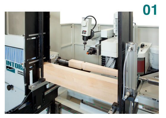
Standard machine: frontal hopper feed loader, horizontal router head, vertical (tilt) router head, shaping and sanding unit.