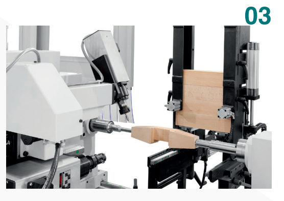
Detail of machining two sofa legs at the same time with tilted vertical router head.