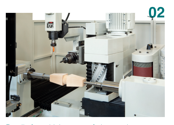
Detail of machining two sofa legs at the same time with straight vertical router head.