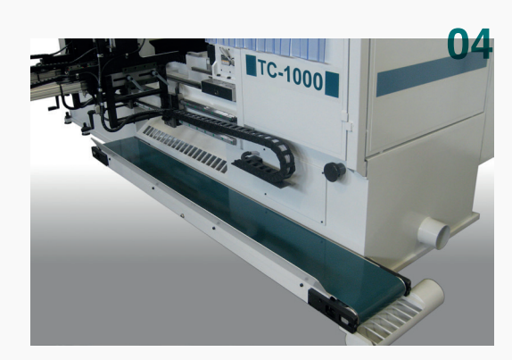
Optional equipment: Transfer exit belt to eject the finished parts.